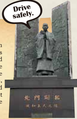
Statue of Gennyō Shōnin at Nakayama Pass†

Construction of that road, the predecessor to National Highway 230, began in 1870. The person who is regarded as having propelled the construction was Gennyō Shōnin of the Higashi Honganji Temple in Kyoto. He encouraged followers to immigrate to Ezo on his way to Ezo. He succeeded in collecting huge sums of construction funds for the road. He was then only 19 years old. The construction of the Hōganji Kaidō took just 15 months. It involved many people, including immigrants from the former Date domain to eastern Hokkaido and Ainu people of the Iburi region. Over 140 years has passed since then. At Nakayama Pass, a statue of Gennyō Shōnin, the driving force behind the Hōganji Kaidō, stands praying for the safety of passers-by.